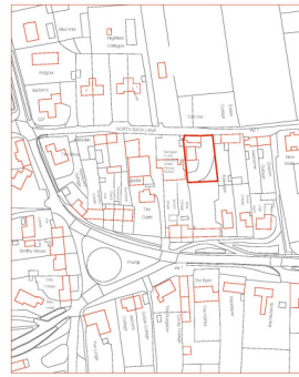
Location 1:2500 North Back Lane Terrington OS Grid Ref. 49875 70151 E 498751 N 470152

THIS DOCUMENT HAS BEEN PREPARED BY OR WITH THE ASSISTANCE OF THE CONSULTANT ENGINEER AND ARCHITECT AND IS NOT TO BE USED FOR ANY OTHER PURPOSE WITHOUT THE WRITTEN PERMISSION OF THE CONSULTANT ENGINEER.